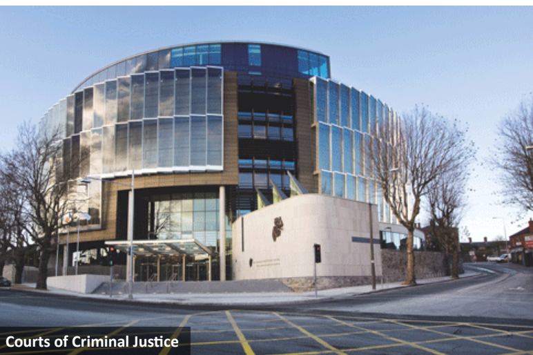
Courts of Criminal Justice

Participants acquire substantial international and comparative focus during this lecture by becoming familiar with the European Union legal framework; its major judicial and law-making institutions; and its case law, doctrines, and legislation. This enables participants to reflect and make apt comparisons with corresponding US law-making processes and legal principles, giving them a broader world view both in terms of legal and socio-legal perspectives.