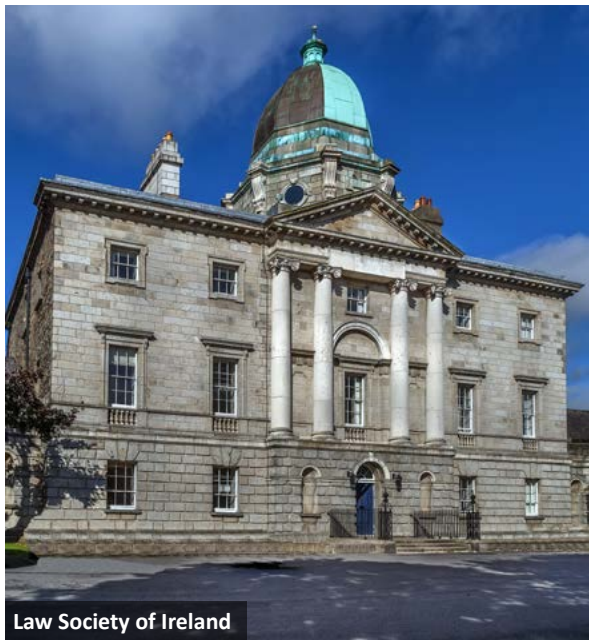
Law Society of Ireland