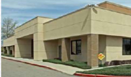
TANDEM DIABETES 95,000 SF @ 1500 SHORELINE DR