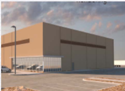
KEYSTONE BUILDING NEW 60,000 SPEC IN CALDWELL