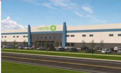
VERDE FULLFILLMENT 168,000 SF BUILD TO SUIT