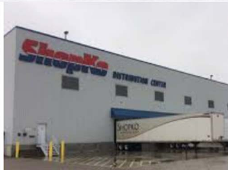
350,000 SF SHOPKO DISTRIBUTION CENTER SOLD/LEASED TO SOLAR COMPANY