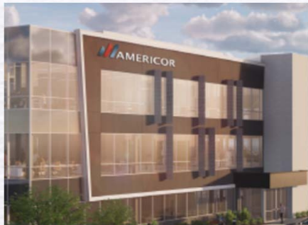
AMERICOR 49,000 SF @ OVERLAND & EAGLE