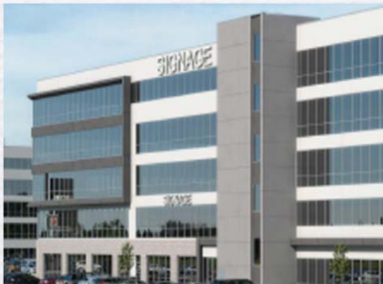
PROSPECTUS 65,000 SF @ 10 MILE & I-84