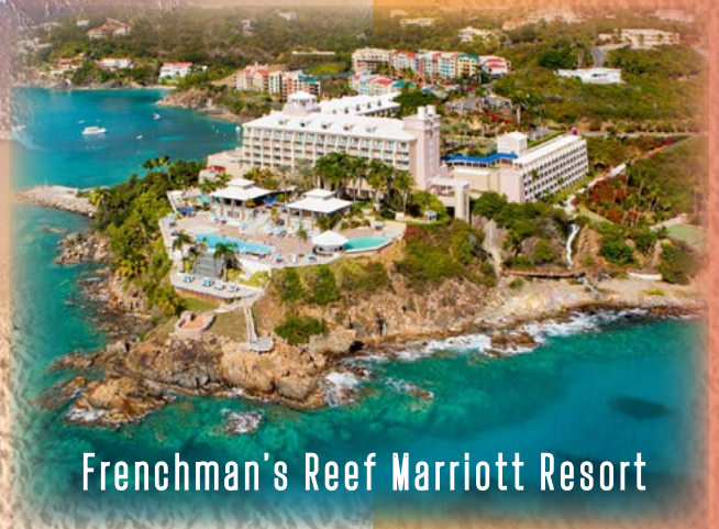
Frenchman's Reef Marriott Resort