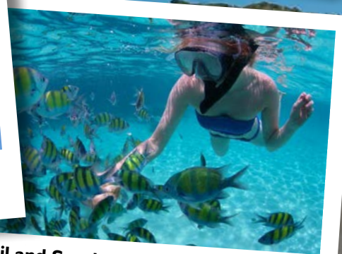
Sail and Snorkel