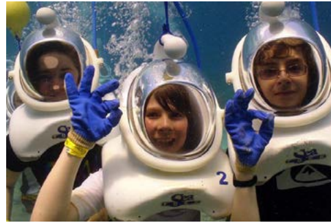
Sea Trek Helmet Dive at Coral World Ocean Park