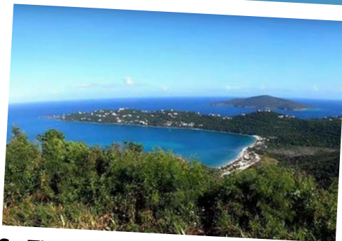
St. Thomas Island Tour with Mountain Top and Magens Bay Beach